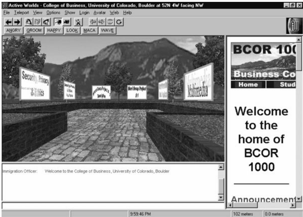
Figure 2: A patio for collaborative assignments

to meet and collaborate on group projects (see Figure 2). Additionally, each patio contains signs that are hypertext links to web-based resources for the group projects. Whilst the 3D environment provides the interface, context, and environment for spatially distant learners to meet and interact, the web browser delivers content and resource information, as well as provides the means by which students submit work and receive feedback about assignments.